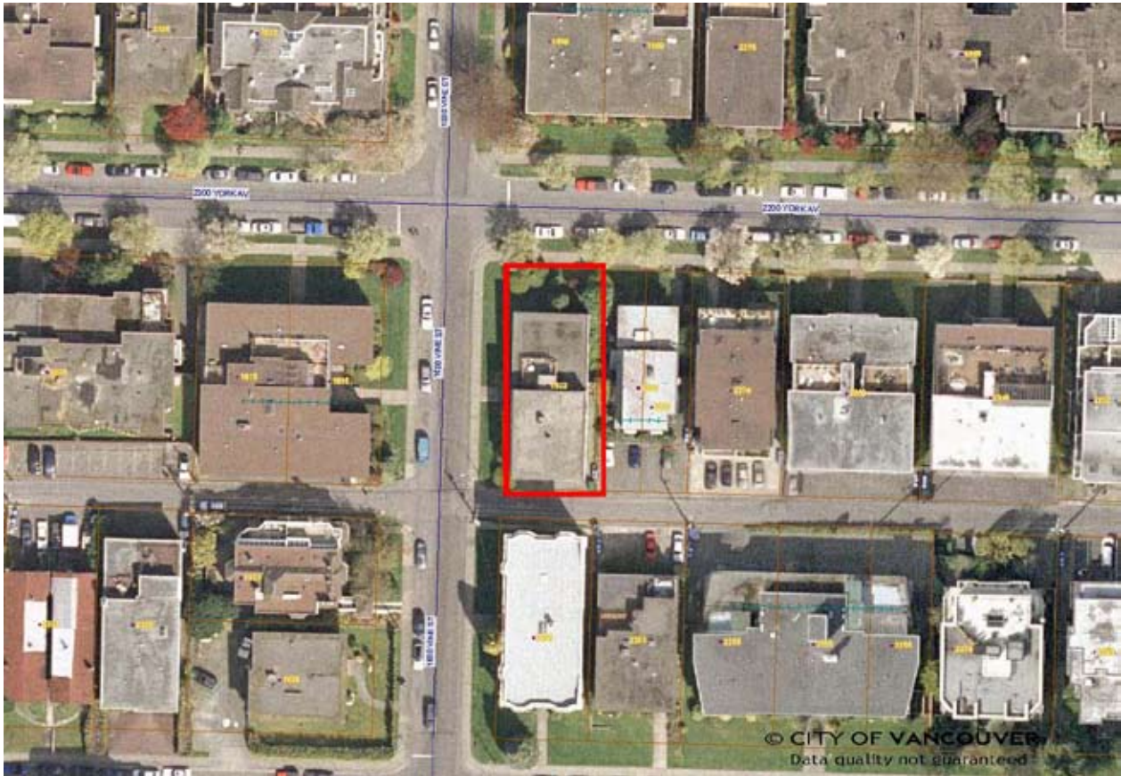
1622 Vine Street, Vancouver, BC

The overall site is rectangular in shape and has a frontage on Vine Street of 120 feet and 50 feet flankage along York Avenue for a total of 6,000 square feet.